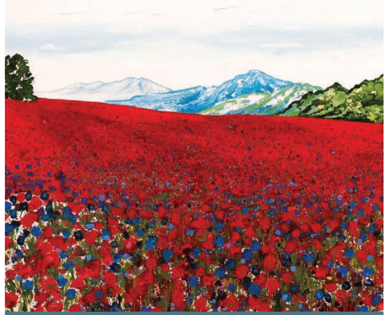
Red poppyfield with cornflowers by Becca Clegg, Art for Christmas, Cranleigh Arts Centre