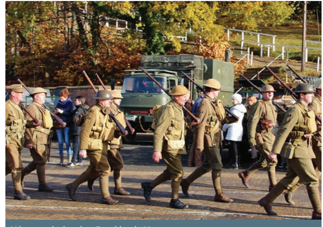
Military vehicles day, Brooklands Museum

See the landscape garden transformed with twinkling, colourful lights and laser beams. Walk the magical, glowing winter trail and listen to a live band, visit food stalls and enjoy a marshmallow camp fire. Visit the new children's experience, Santa's Toy Factory, to see presents being made and receive a gift.