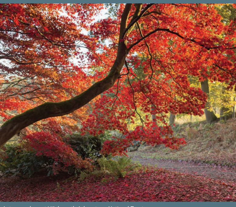
Autumn colour at Winkworth Arboretum, National Trust