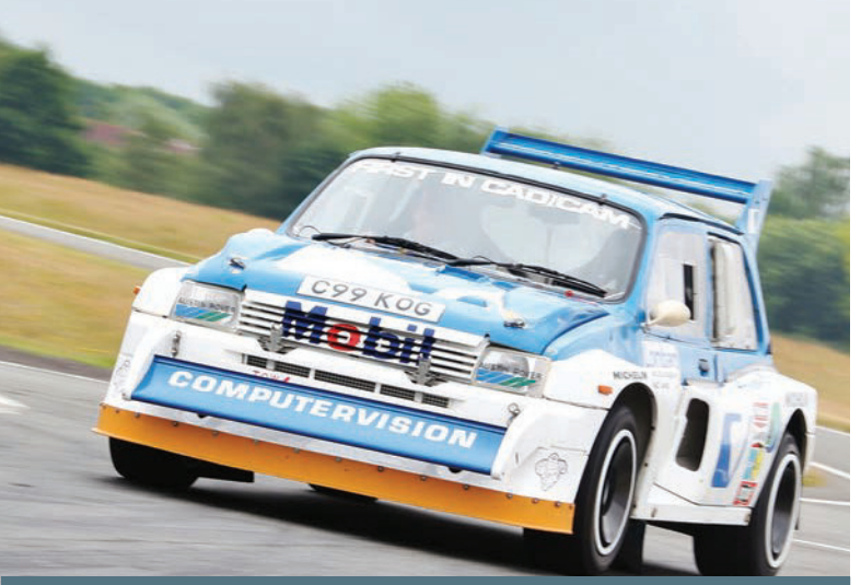
Autumn Motorsport Day, Brooklands Museum