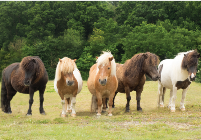
The very beautiful Shetlands, Mane Chance Sanctuary

To Sunday 23 December Painshill festive illuminations Walk the glowing winter trail around the landscape garden.