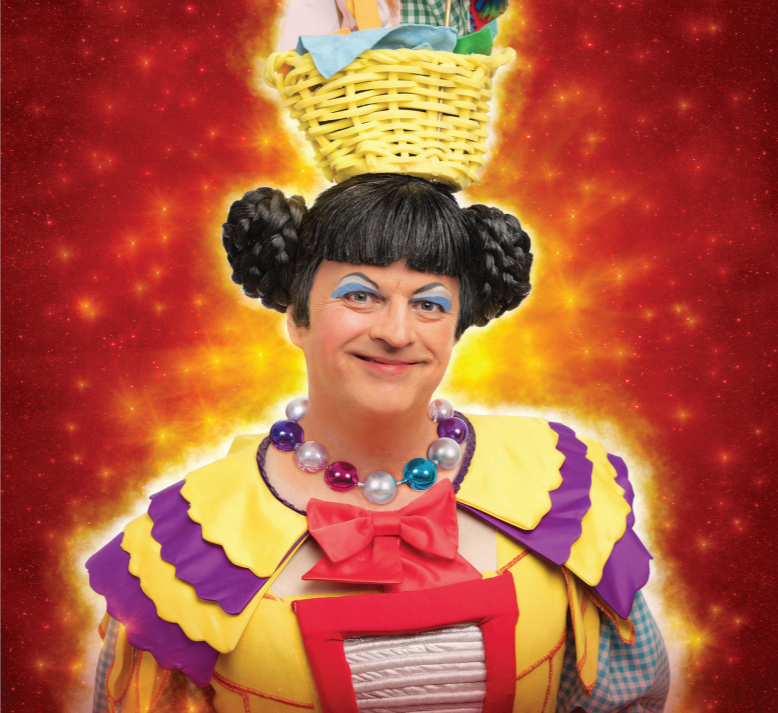
Paul Merton as Widow Twankey, Aladdin , New Wimbledon Theatre

Friday 7 December to Sunday 6 January Cinderella Starring Michelle Gayle as The Fairy Godmother.