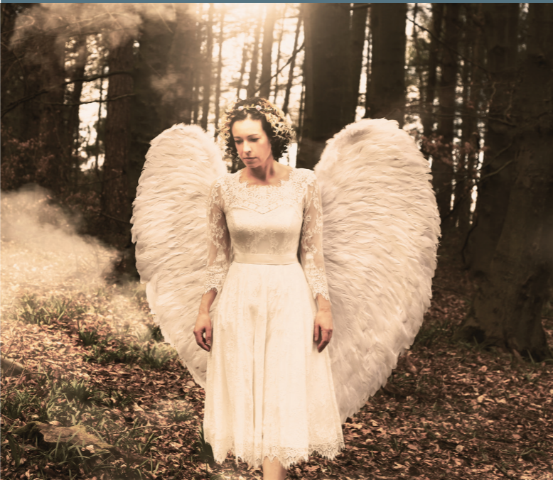
Kate Rusby at Christmas, G Live