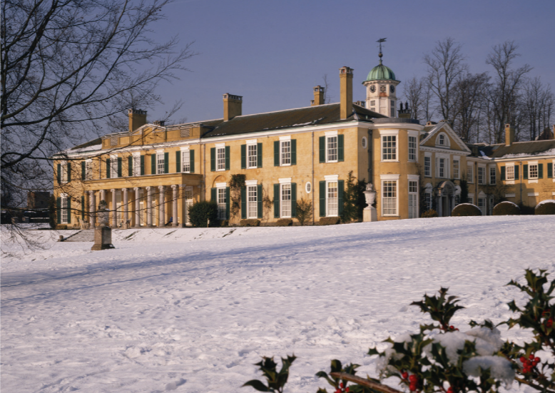
Polesden Lacey in winter