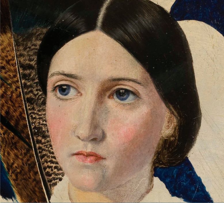
Portrait of Christina Rossetti, 1857, by John Brett, Watts Gallery

Wednesday 26 December to Tuesday 1 January, 10am–3pm Party like it's 1819 trail 2019 is the 200th anniversary of Queen Victoria's birth. Discover what it would have been like at a New Year's Eve party 200 years ago.