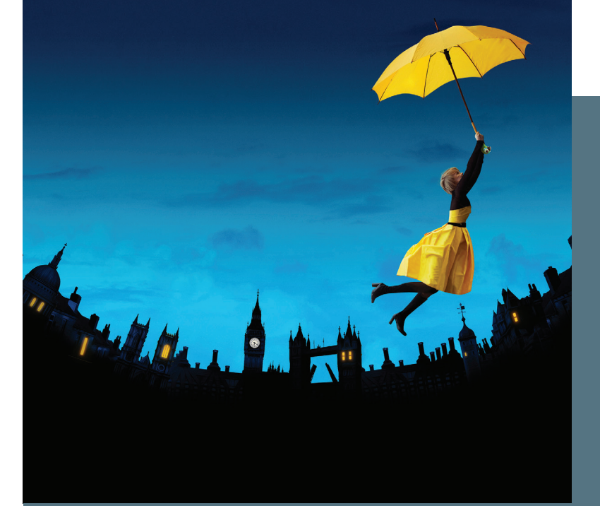
A Spoonful of Sherman, Yvonne Arnaud Theatre

A live rock band and singers perform music from artists such as Dire Straits, Status Quo, Queen, David Bowie and more in aid of Help for Heroes.