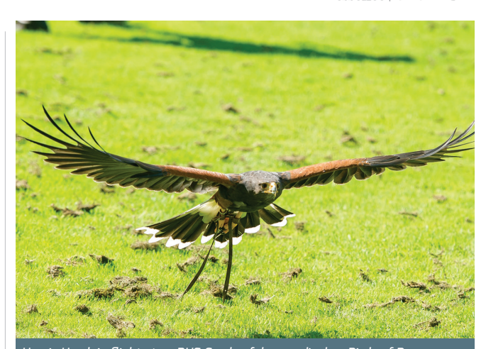
Harris Hawk in flight at an RHS Garden falconry display, Birds of Prey, RHS Garden Wisley

An annual 46 or 65 mile cycling challenge in aid of The Children's Trust, Tadworth Court.