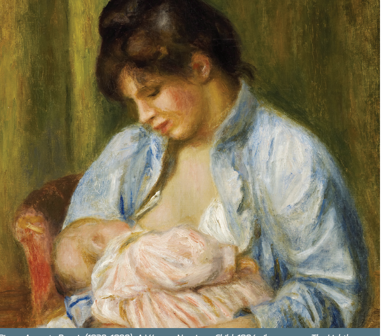
Pierre-Auguste Renoir (1839–1899), A Woman Nursing a Child, 1894 oil on canvas, The Lightbox