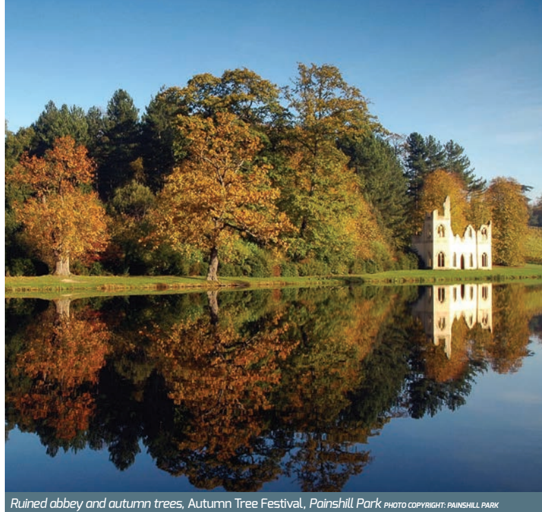
Ruined abbey and autumn trees, Autumn Tree Festival, Painshill Park