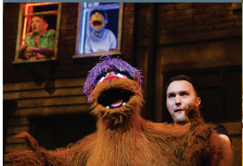
Avenue Q, New Victoria Theatre, Woking