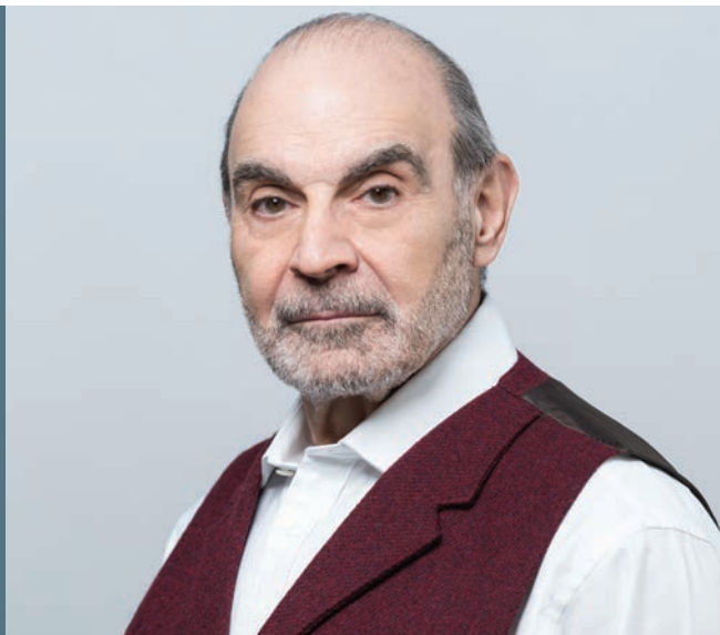
David Suchet, 2019 Guildford Book Festival.