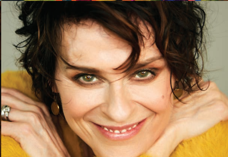
Lisa Stansfield, G Live