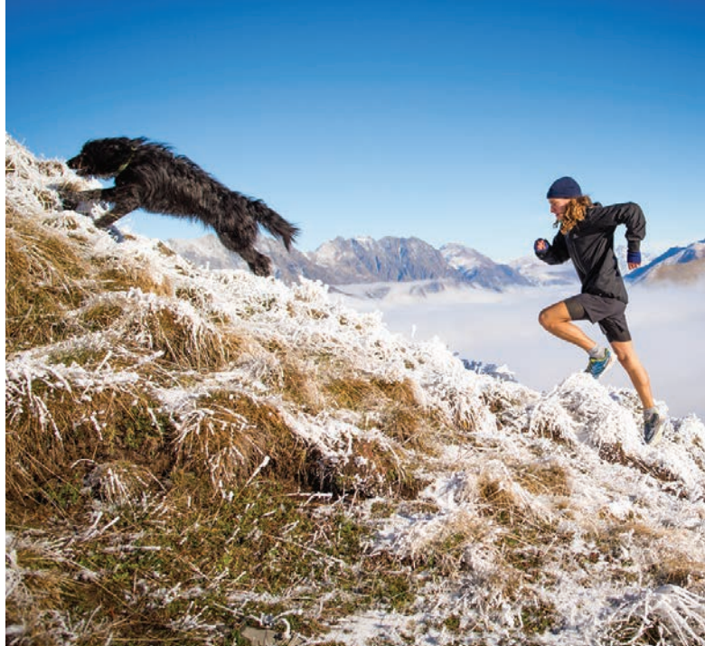
Trail Dog, Top Dog Film Festival, Dorking Halls

Terms and conditions: One reader will win four band A tickets to see the production of their choice, valid for Monday to Thursday performances until 28 November 2019. Accommodation and travel are not included. Subject to availability. No cash alternative available.